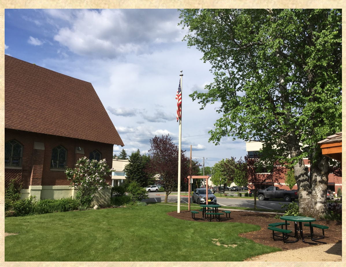
First Presbyterian Church